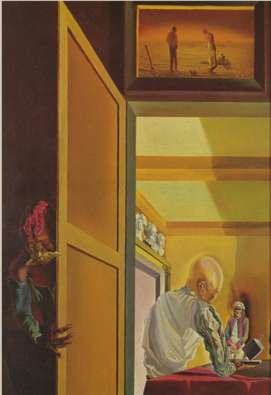
Salvador Dalí: Gala and The Angelus of Millet Before the Imminent Arrival of the Conical Anamorphose s (1933)