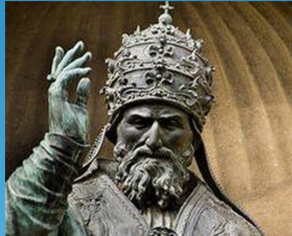
Pope Gregory XIII