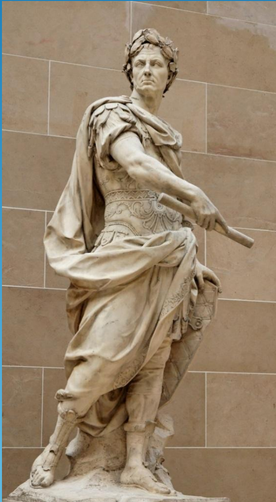
Julius Caesar The Roman Emperor