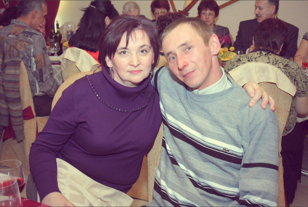
Mother and Father