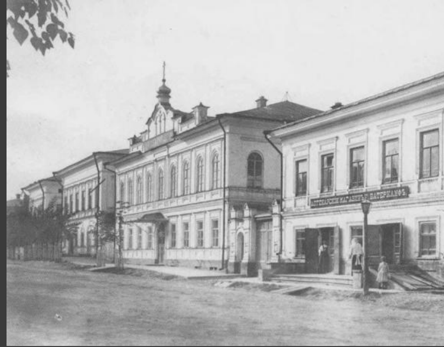
Leninogorsk medical college