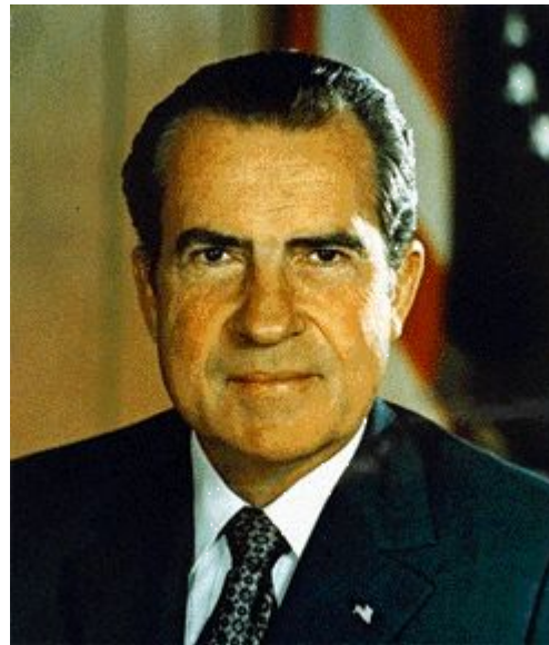
Richard Nixon 1969-74