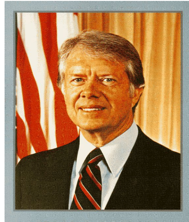
Jimmy Carter 1977-81