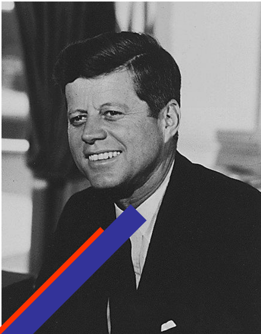
John F Kennedy 1961-63