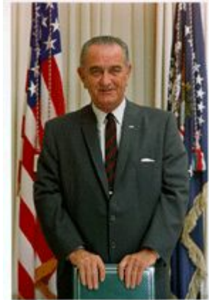
Lyndon B Johnson 1963-68