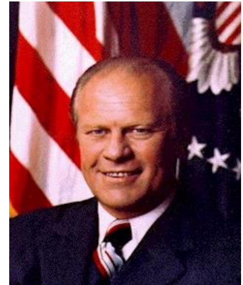
Gerald Ford 1974-77