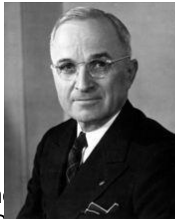
Harry S. Truman 1945-53 The President of the USA