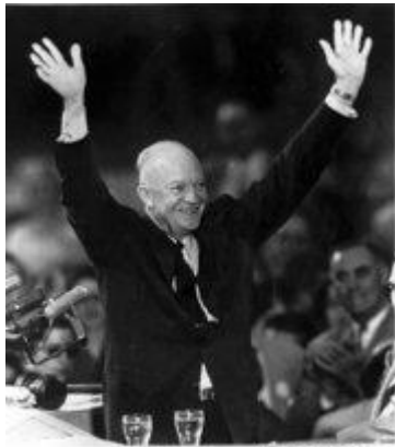
Dwight Eisenhower 1953-61