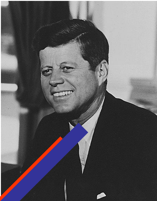
John F Kennedy 1961-63