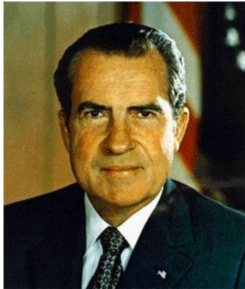
Richard Nixon 1969-74