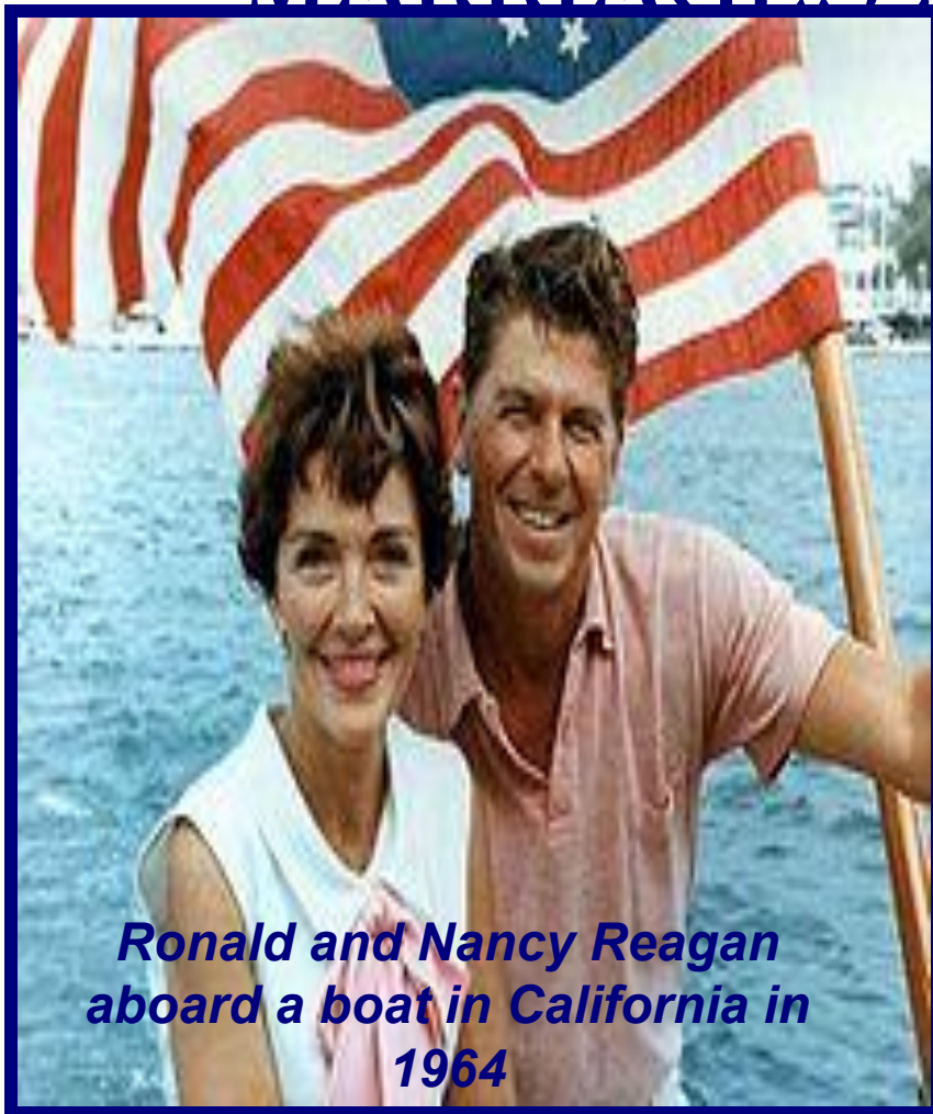
Ronald and Nancy Reagan aboard a boat in California in 1964