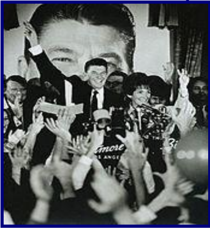
Ronald and Nancy celebrate Reagan's gubernatorial victory