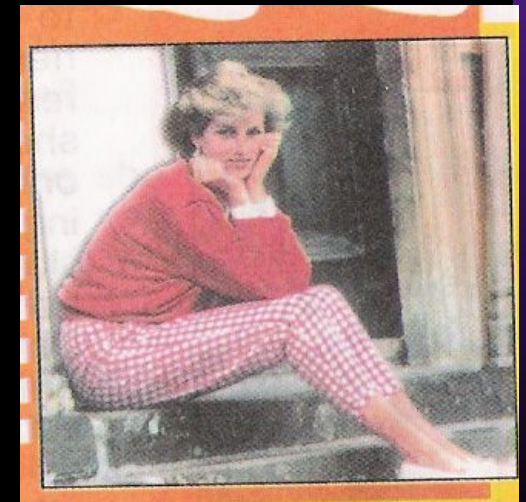
It was summer 1986.

The world was her stage and she dressed for the role of leading lady. She became a woman of vision, queen of style.