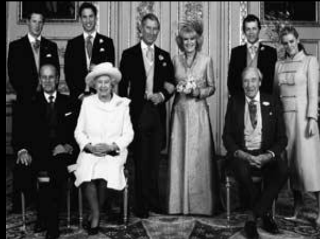
The Prince of Wales, the new Duchess of Cornwall and families after their wedding at Windsor on 9 April 2005

His title is the Prince of Wales. He studied at Trinity College, Cambridge, before serving in the Royal Air Force and Royal Navy. He is known for his interest in architecture and the environment.