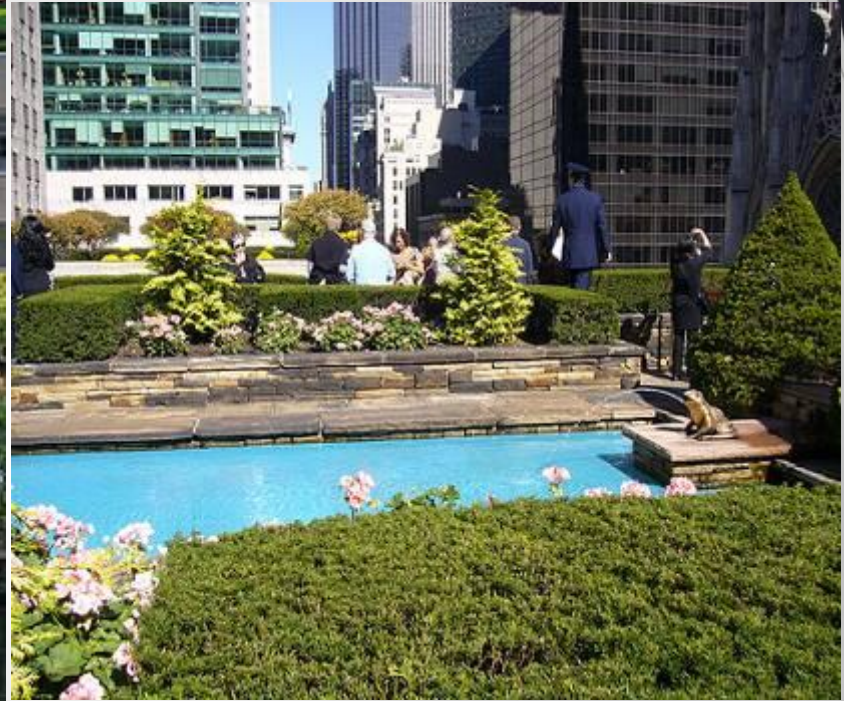
ROOF GARDEN OF ROCKEFELLER PLAZA BUILDINGS