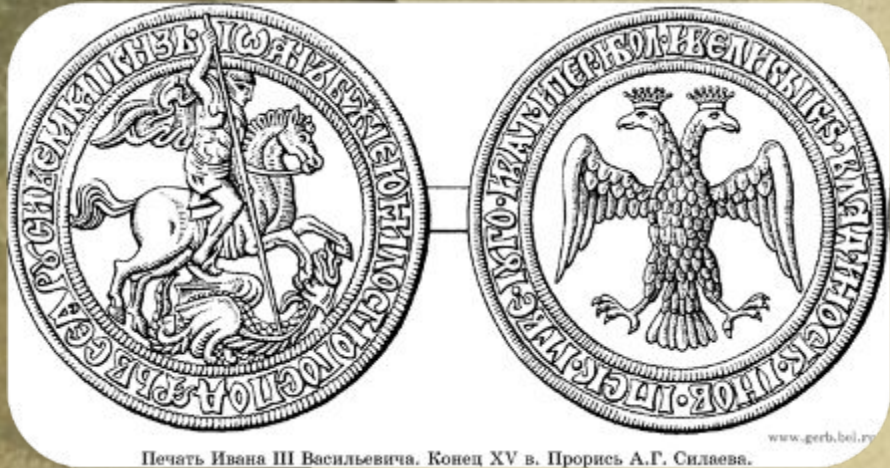
Печать Ивана III Васильевича. Конец XV в. Прорисъ А.Г. Сидова.

The first emblem of the double-headed eagle was introduced in 1480 by Prince Ivan III.