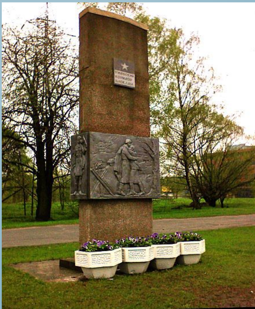
One of the monuments "Rzhev corridor" on the road of the Revolution