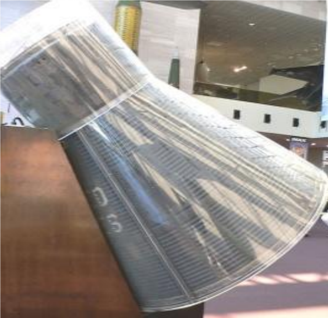
Mercury Friendship 7 Spacecraft