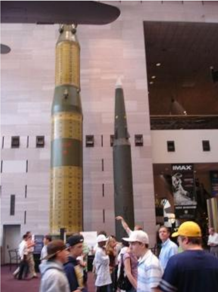
Soviet SS-20 and U.S. Pershing II rockets