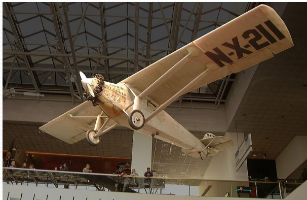
the Spirit of St. Lous

There are a lot of space rockets and a lunar landing module. It is also has the original airplane used by the Wright Brothers and «the Spirit of St. Lous»; the first plane to cross the Atlantic, which Charles Lindbergh flew from New York to Paris.