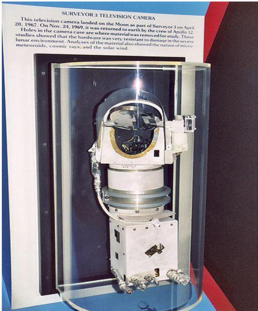
The Surveyor 3 camera