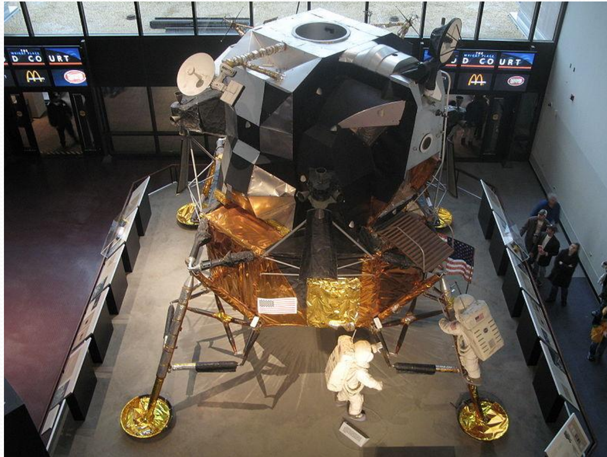
Apollo Lunar Module