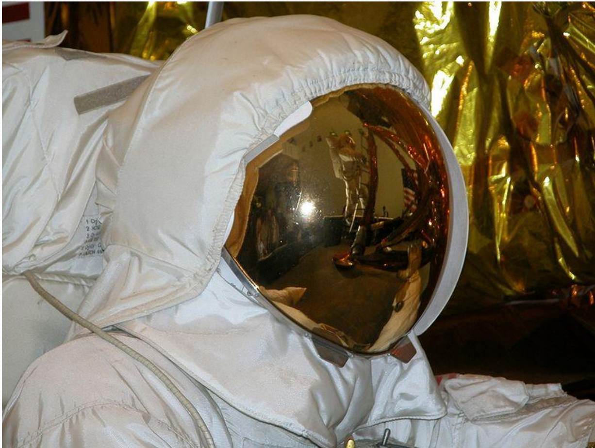
Lunar space sui