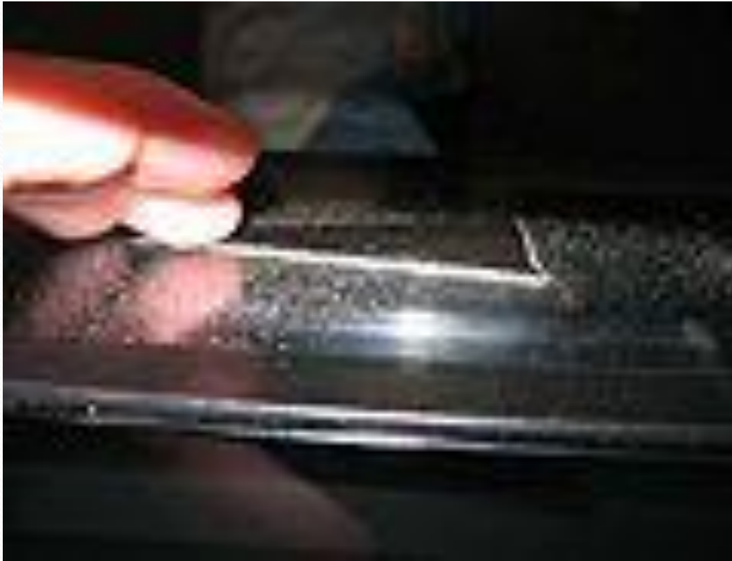
Moon rock from Apollo 17