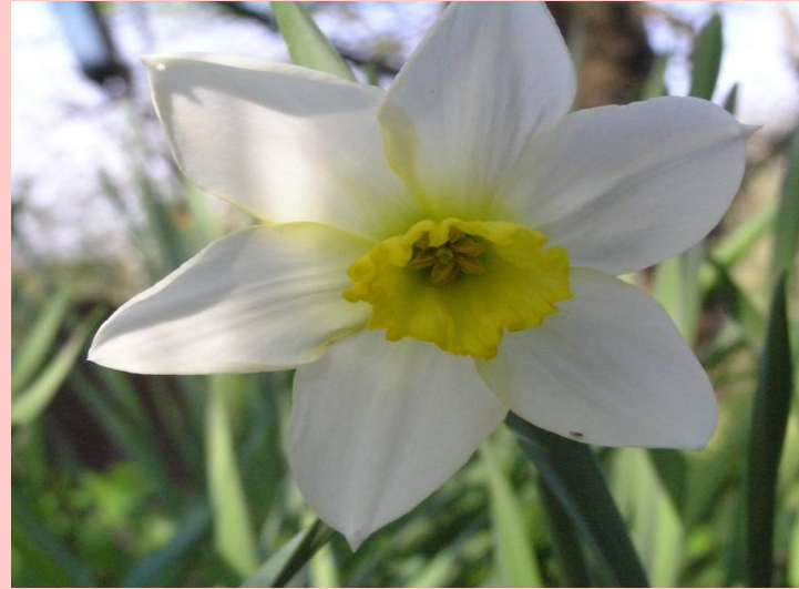
the symbol of Wales is the daffodil