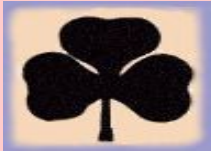
The symbol of Nothern Ireland is the shamrock