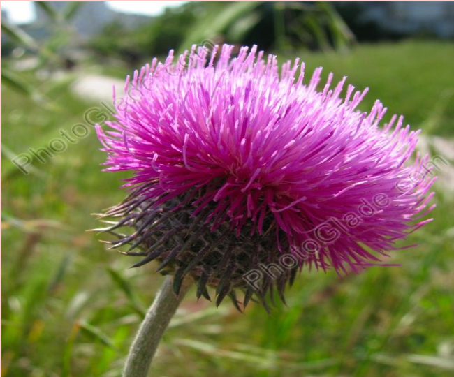
the symbol of Scotland is the thistle