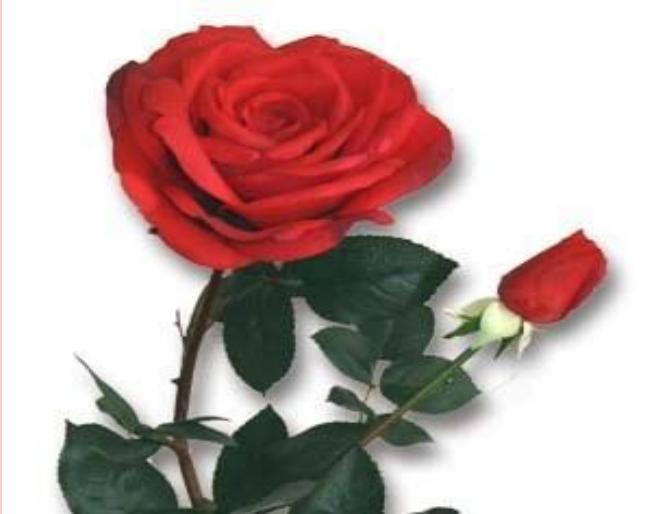
the symbol of England is the red rose