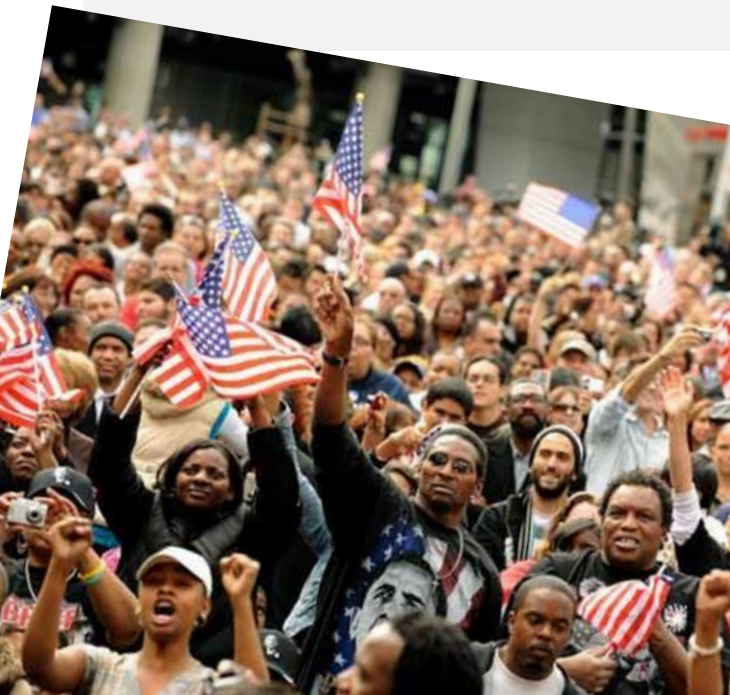
Соединённые Штаты Америки / Население