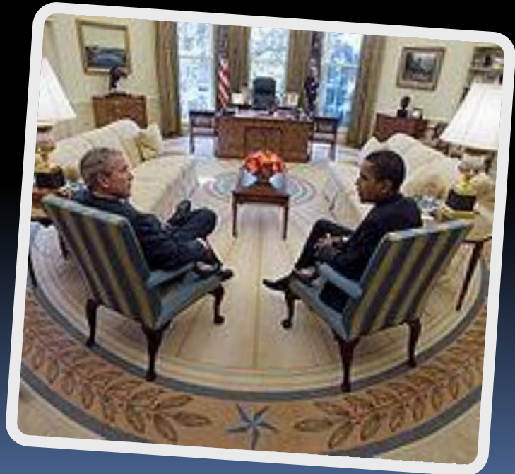
PRESIDENT-ELECT BARACK OBAMA (RIGHT) MEETS WITH CURRENT PRESIDENT GEORGE W. BUSH (LEFT) IN THE OVAL OFFICE, NOVEMBER 10, 2008.