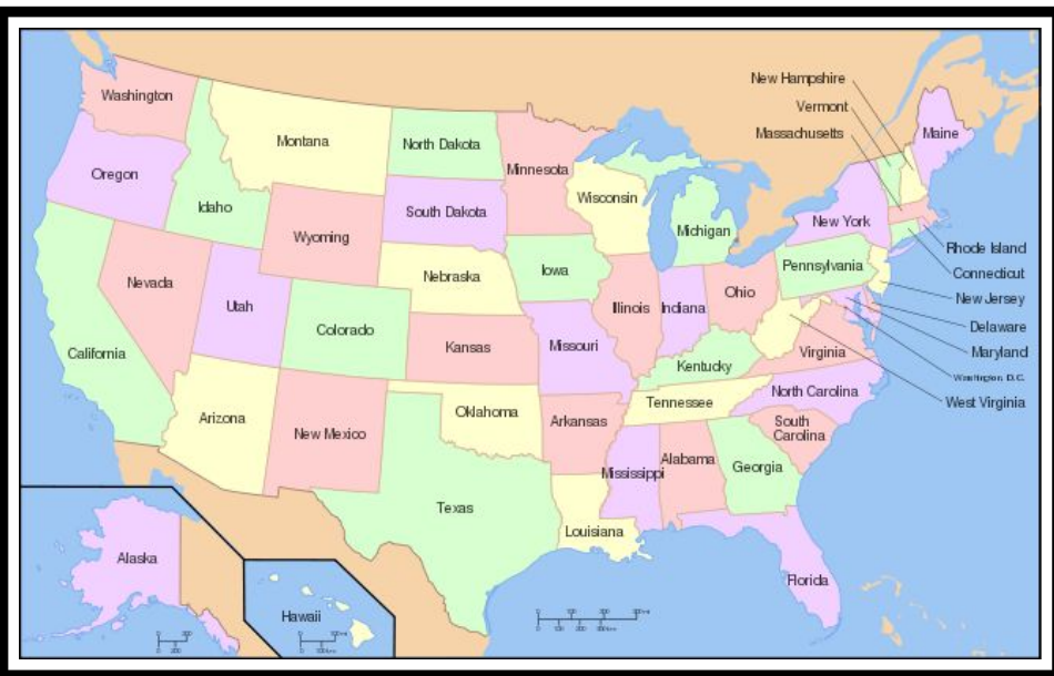
Map of USA with state names.