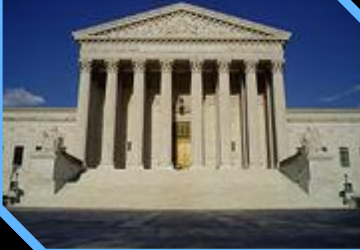
The front of the United States Supreme Court building.