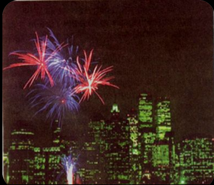
Firework on Independence Day.