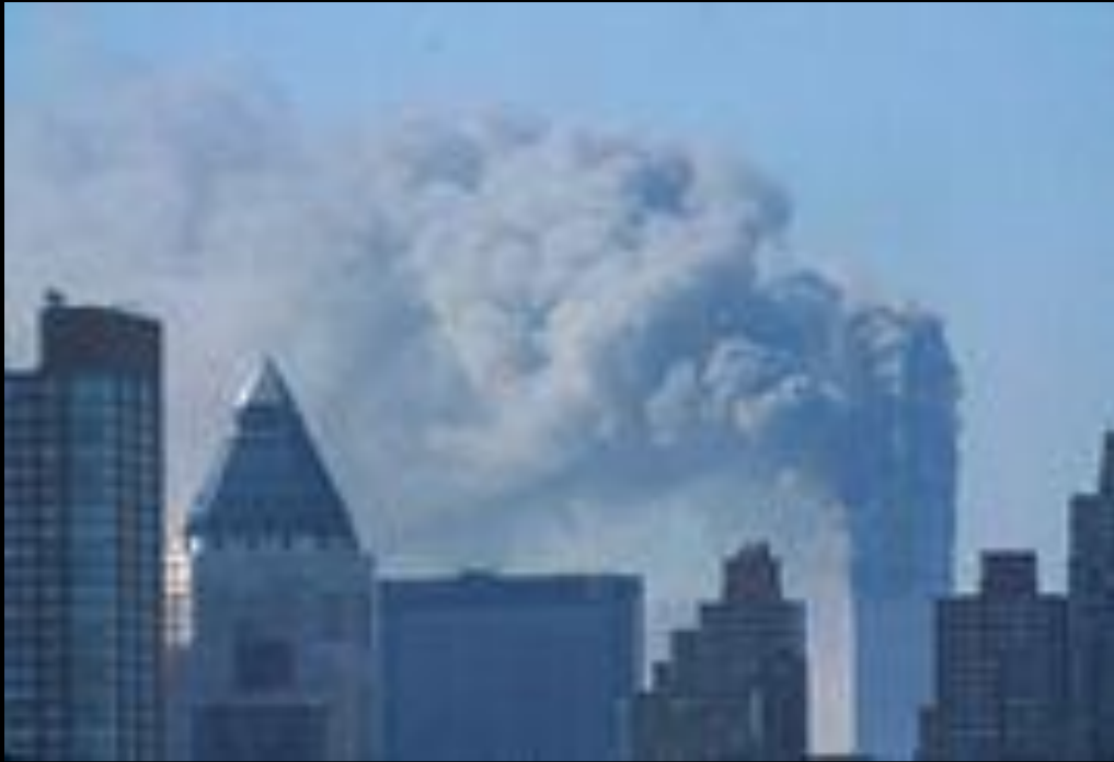
The WORLD TRADE CENTER on the morning of September 11, 2001.