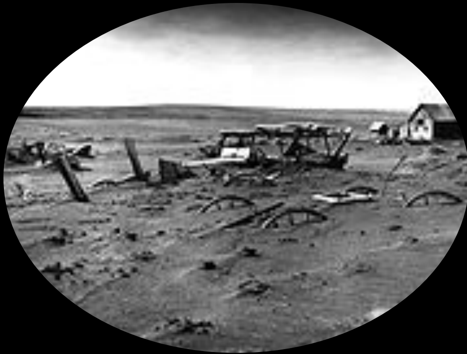
An abandoned farm in South Dakota during the Dust Bowl, 1936.

The bald eagle has been the national bird of the US since 1782.