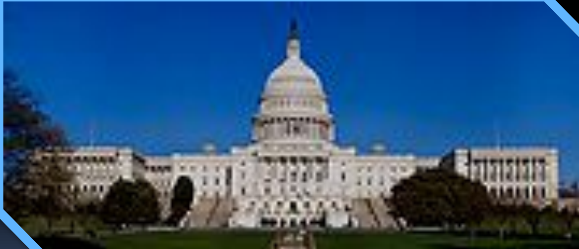
The west front of the United States Capitol, which houses the United States Congress.(puc 4.)