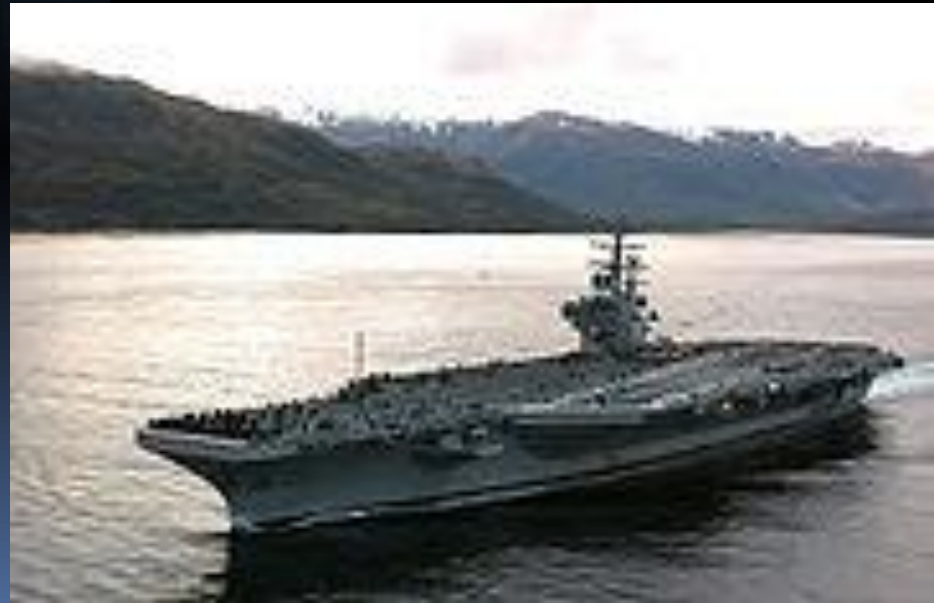
The USA Ronald Reagan supercarrier.