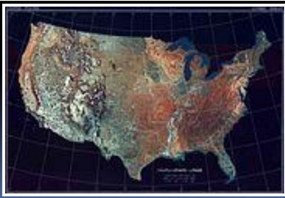
TOPOGRAPHIC MAP OF THE CONTIGUOUS US.