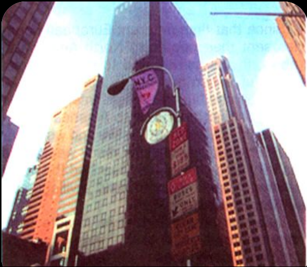
Skyscrapes in New York.