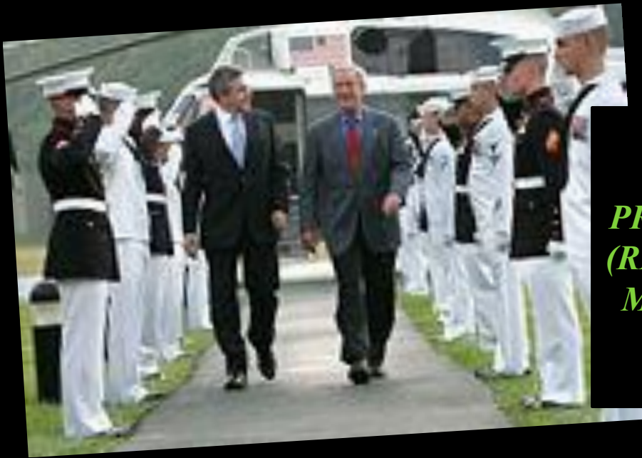
PRESIDENT GEORGE W. BUSH (RIGHT) WITH BRITISH PRIME MINISTER GORDON BROWN.