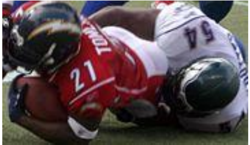
The Pro Bowl (2006), American football's annual all-star game.(puc 6)