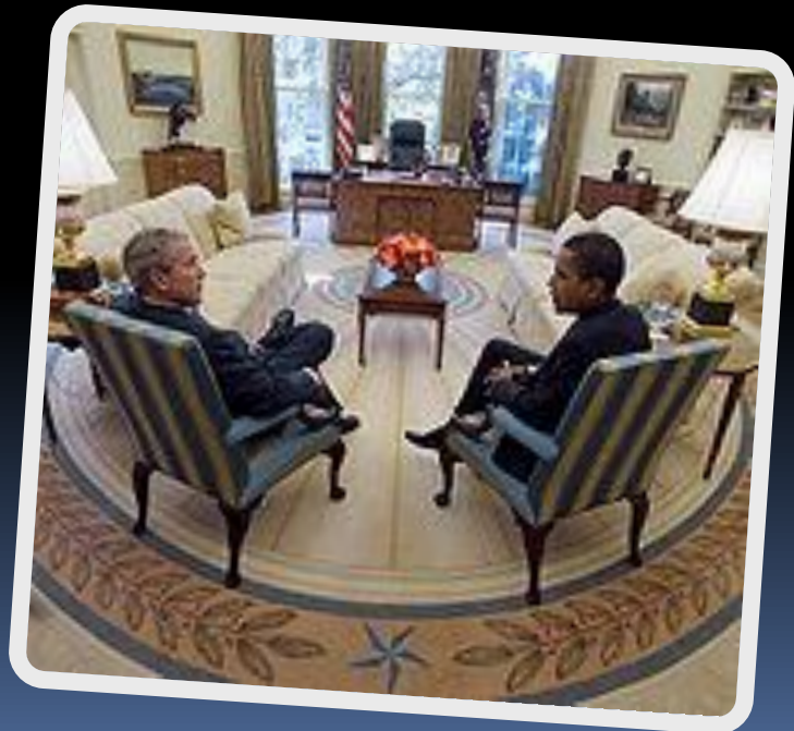
PRESIDENT-ELECT BARACK OBAMA (RIGHT) MEETS WITH CURRENT PRESIDENT GEORGE W. BUSH (LEFT) IN THE OVAL OFFICE, NOVEMBER 10, 2008.