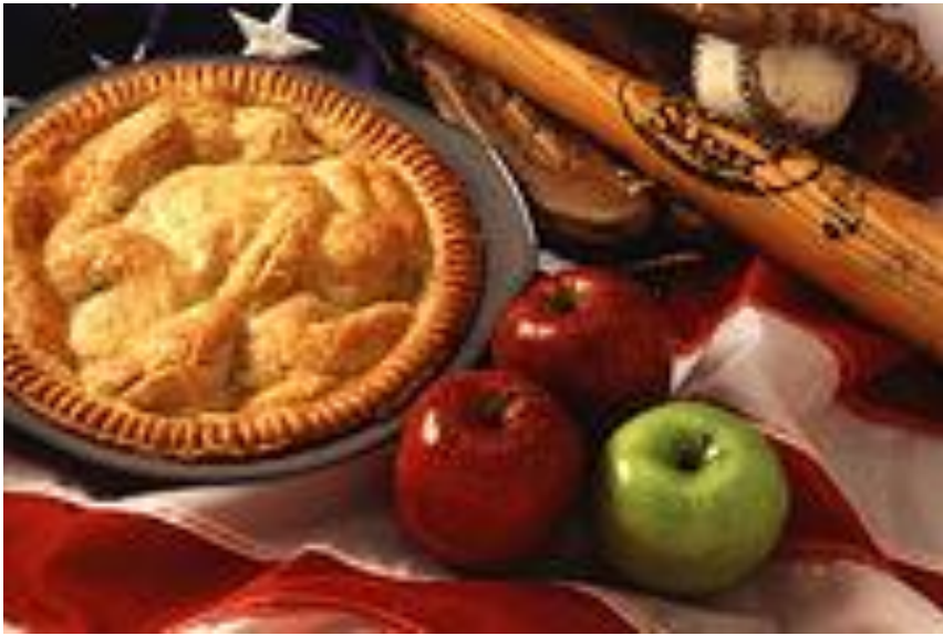
Food US.(puc 5)