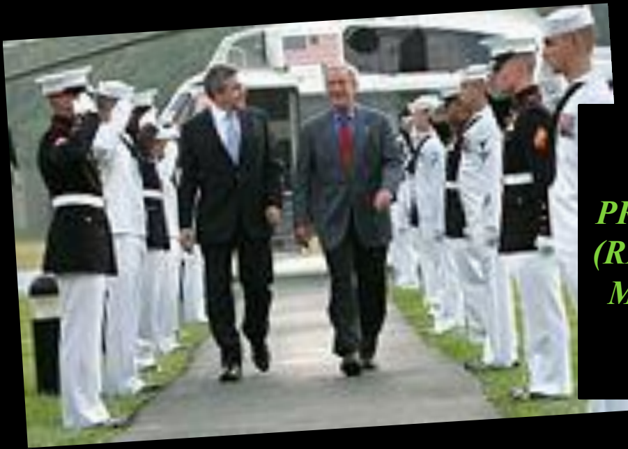
PRESIDENT GEORGE W. BUSH (RIGHT) WITH BRITISH PRIME MINISTER GORDON BROWN.