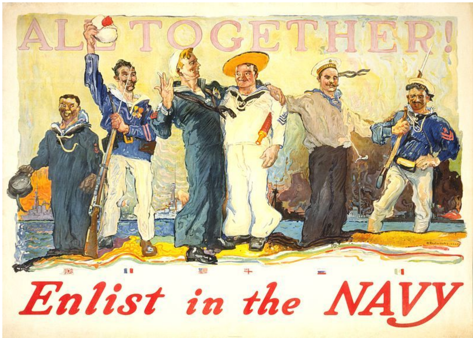
Naval recruitment poster (1917)