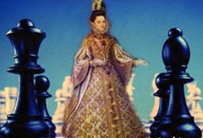
QUEEN OF SPAIN