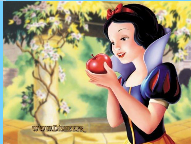
The Snow White and the seven Dwarfs