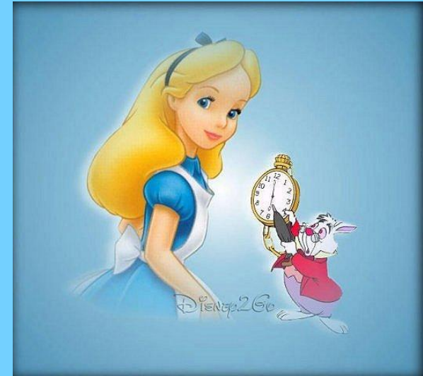
Alice's in the Wonderland