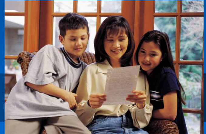
Relationship with the mates