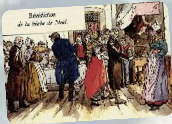
Sketch for a postcard by P. Kaufman.