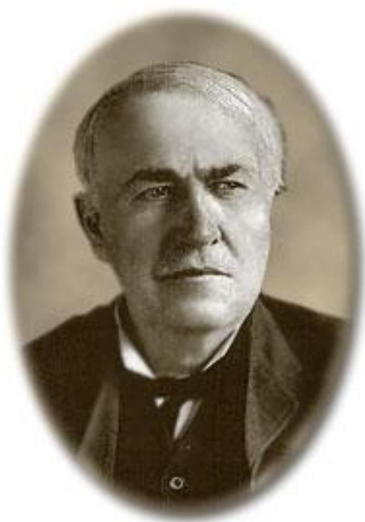
Thomas Alva Edison (1847-1931)