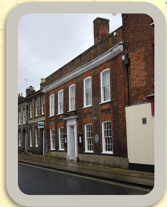
Thomas Gainsborough's house