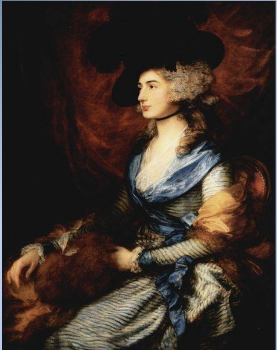
“Mrs. Sarah Siddons”