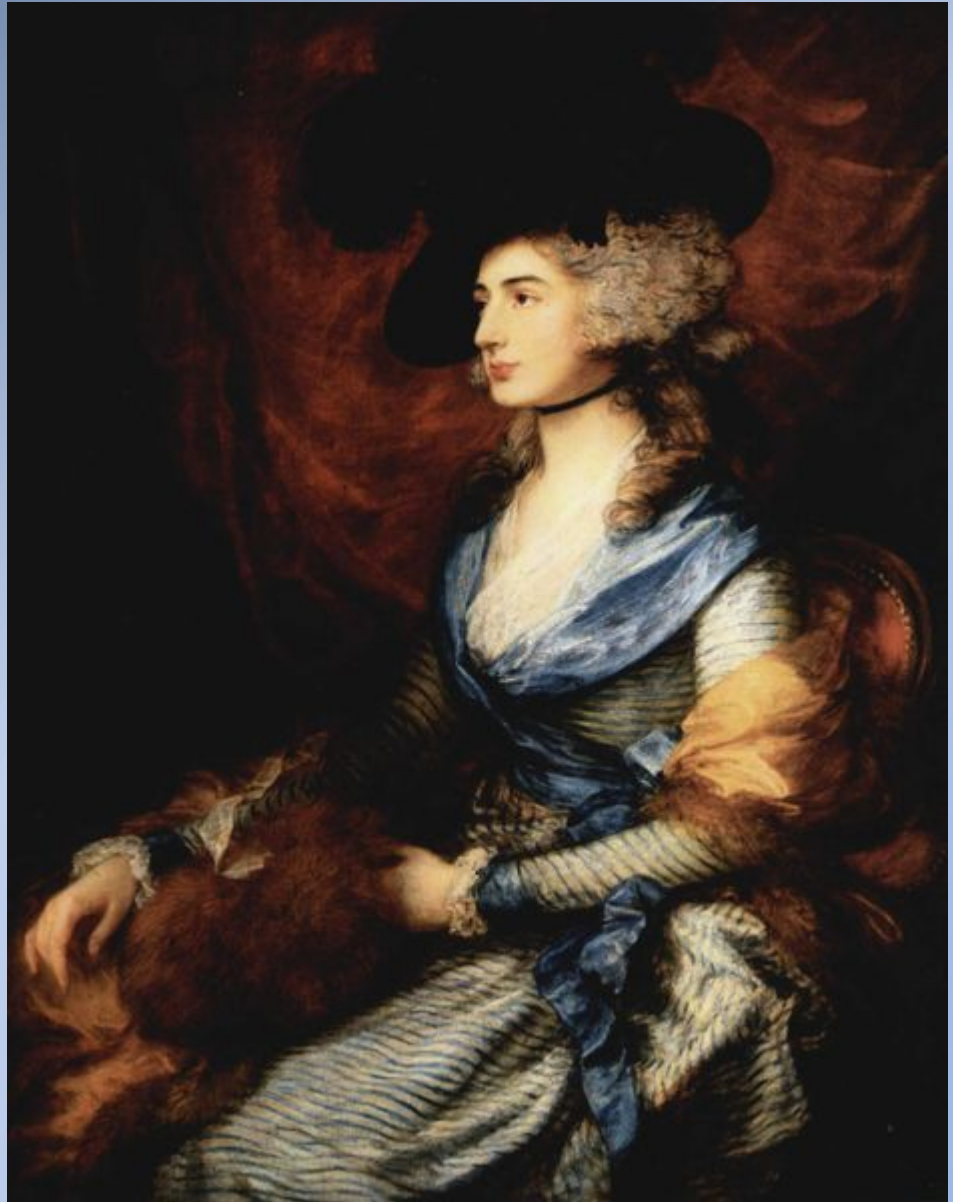
“Mrs. Sarah Siddons”