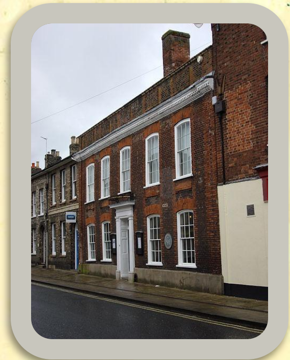
Thomas Gainsborough's house