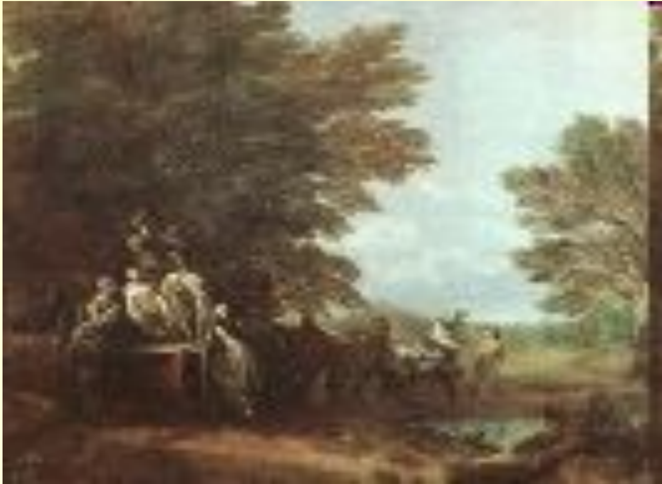
The Harvest Wagon (c. 1767)