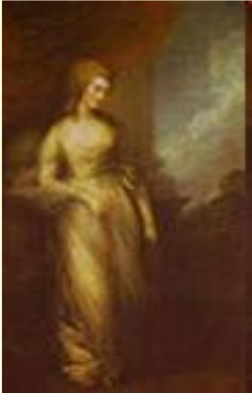
Her Grace Georgiana Cavendish, Duchess of Devonshire (1783)