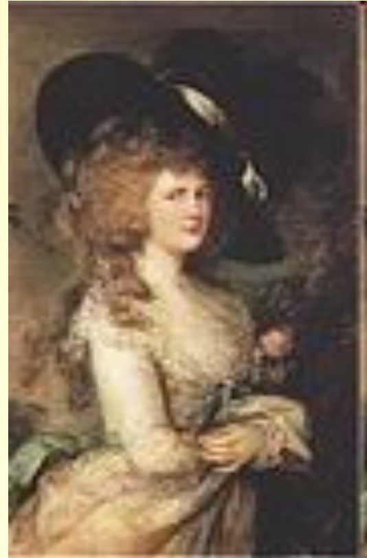
Her Grace Georgiana Cavendish (1787)