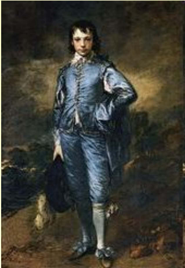
The Blue Boy (1770).