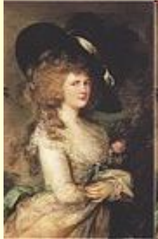
Her Grace Georgiana Cavendish (1787)