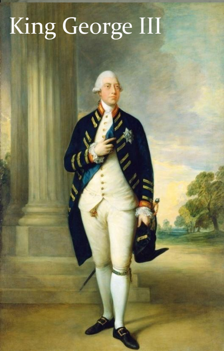
King George III