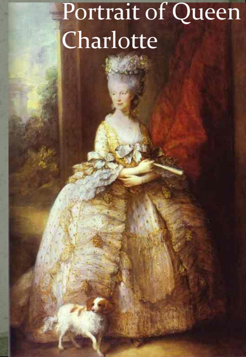
Portrait of Queen Charlotte