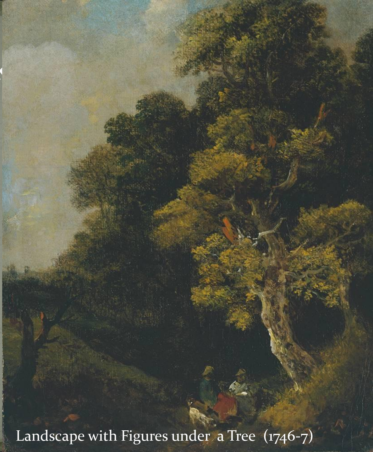
Landscape with Figures under a Tree (1746-7)