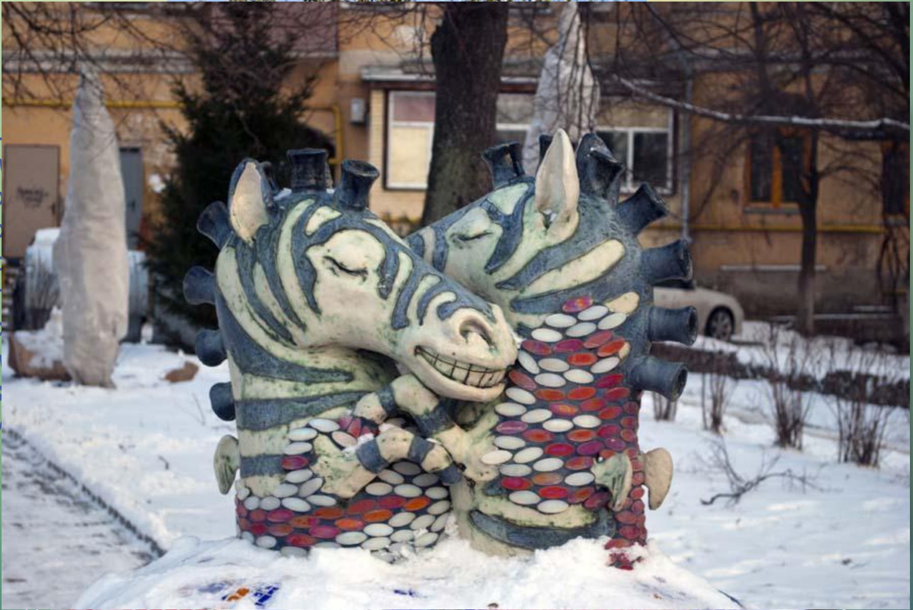
Abramam's colorful sculpture and life through