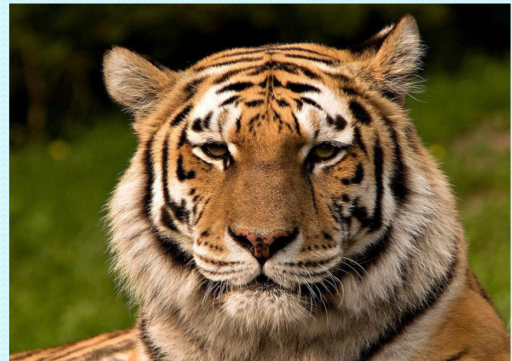
Siberian Tigers are on the verge of extinction.