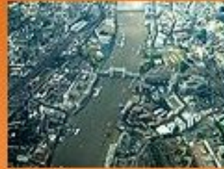
Tower Bridge area from the air