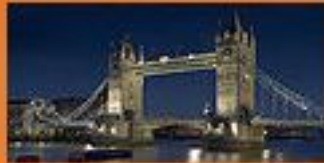
Tower Bridge at night