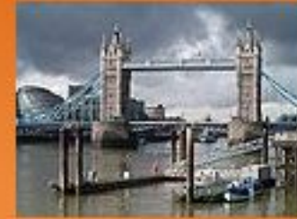
Tower Bridge seen from the north bank of the Thames