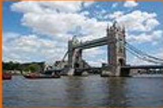
Tower Bridge during day