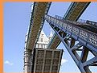
Close-up of opened bascules