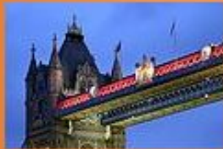
Close-up of walkways, illuminated at dusk