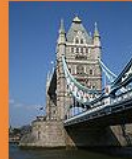
The south tower, showing pier at river level