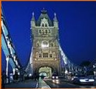
South view at dusk