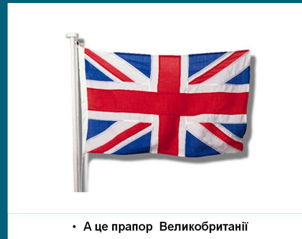
• А це прапор Великобританії