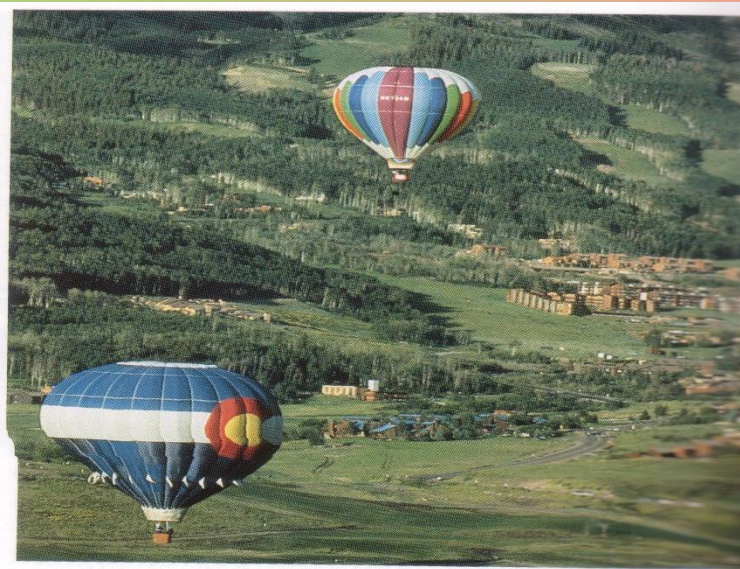
Hot-air balloons over the mountains