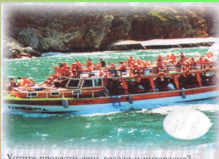
Хотите провести день весело и интересно?