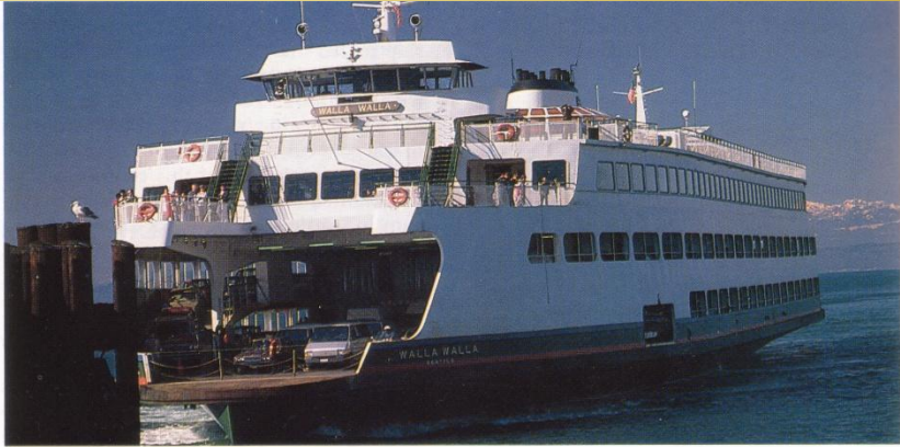
Some people commute by car and ferry on Puget Sound.