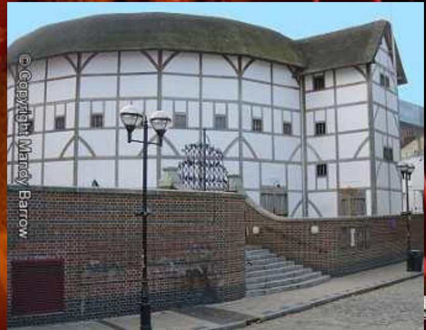
Globe Theatre in London

The Globe Theatre was built on the River Thames. It was circular and had seats around the walls which cost two pence or three pence if you had a cushion.