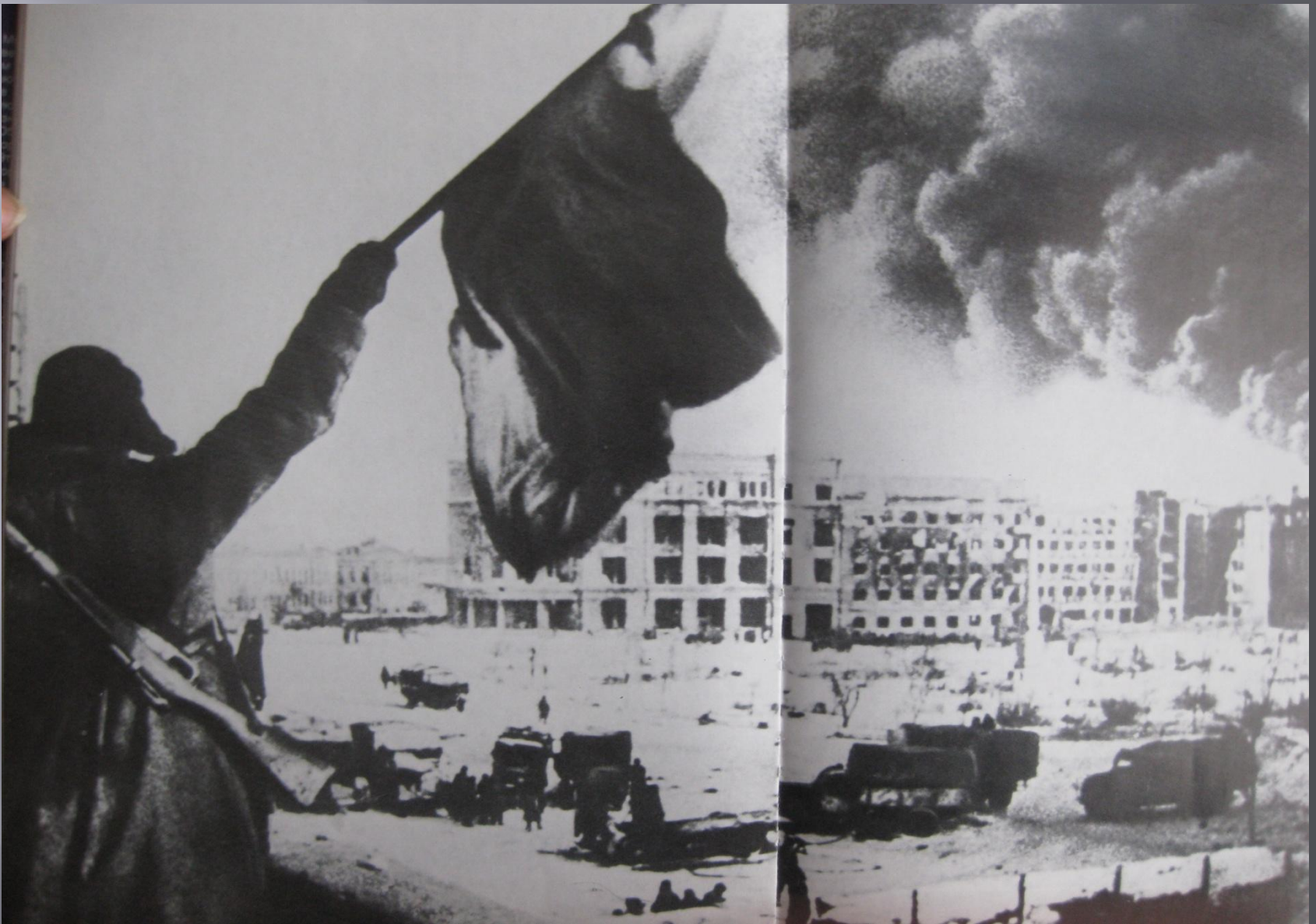
Victory banner raised over Stalingrad