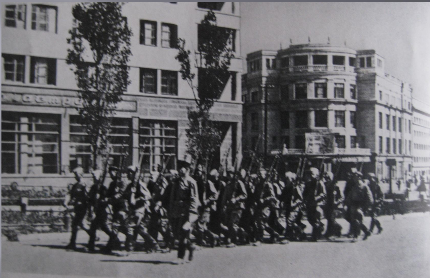
Panorama of front-line Stalingrad June 1942