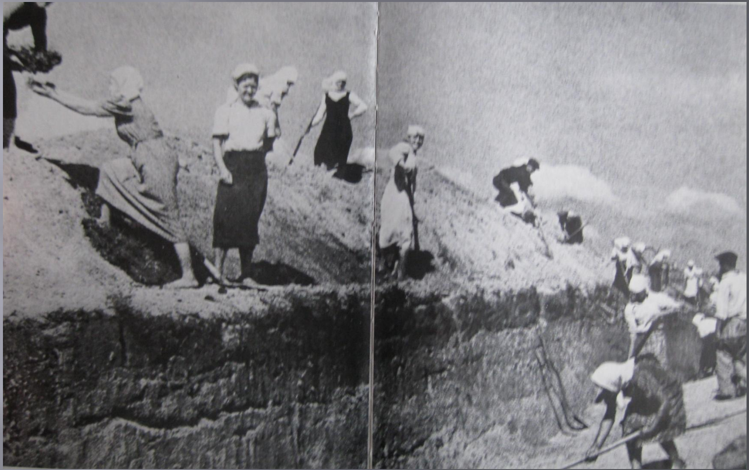
The people of Stalingrad fortify their city