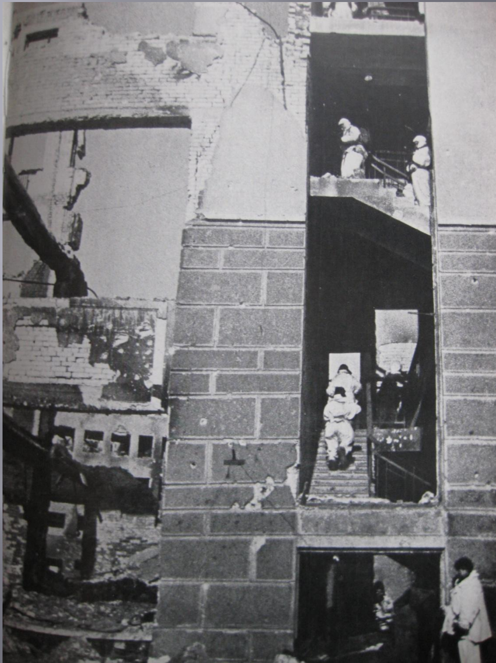
Fighting for a house