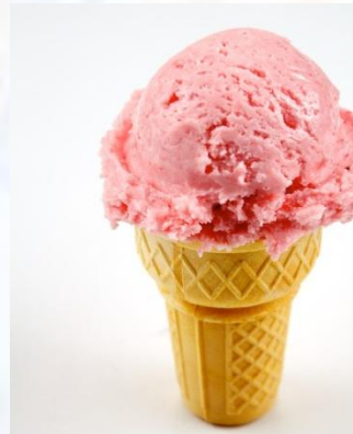
an ice cream