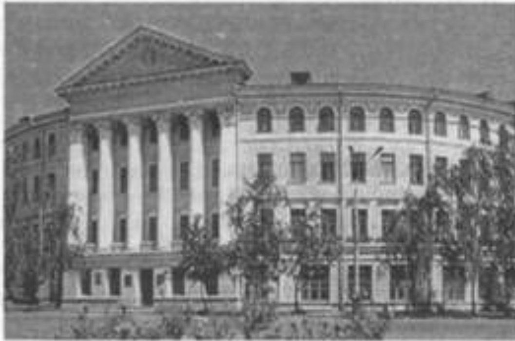
Національний університет «Кис'во-Могилянська академія».