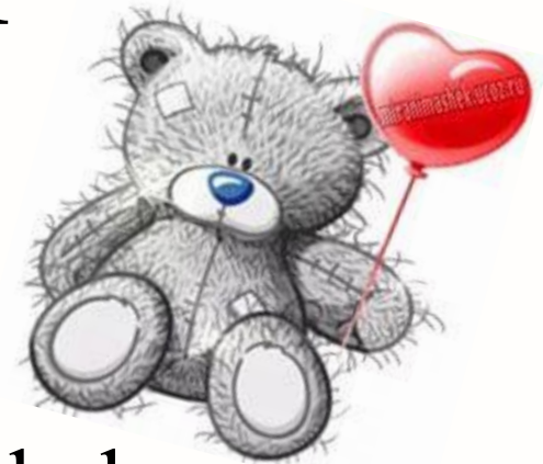
A teddy bear