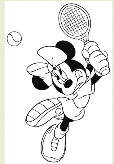
to play tennis