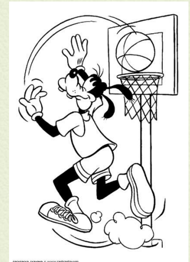
to play basketball