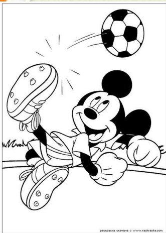
to play football