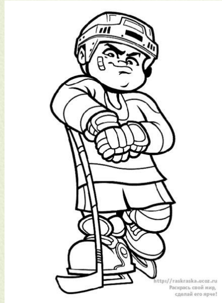
to play hockey