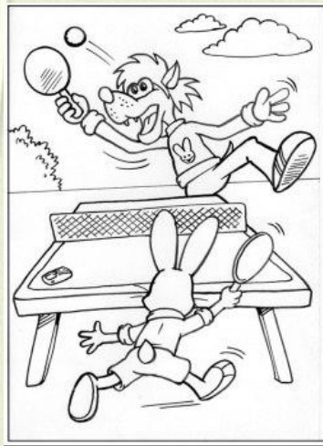
to play table tennis