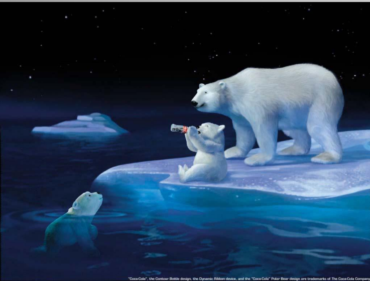
"Coca-Cola", the Contour Bottle design, the Dynamic Ribbon device, and the "Coca-Cola" Polar Bear design are trademarks of The Coca-Cola Company.