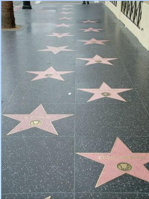
Avenue of Stars in Hollywood

Landmarks: Hollywood, the center of the film industry in 1911, Disneyland, Museum of Art - John Paul Getty.