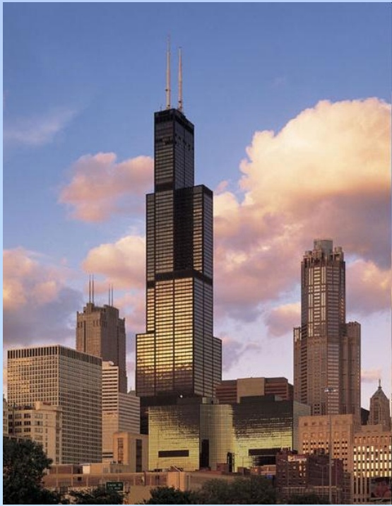
Business Center. Chicago

Population: 3 million in the city, 9.7 million - in the metropolitan area