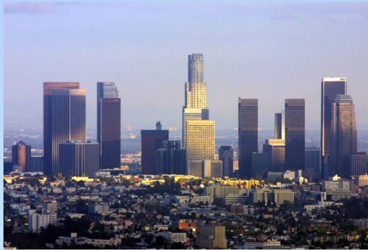
Center of Los Angeles