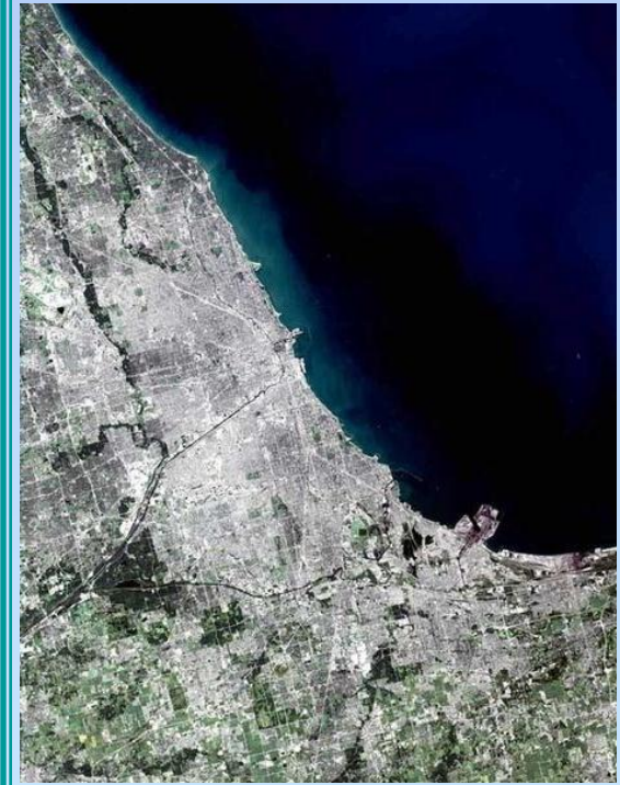
Lake Michigan and Chicago from space