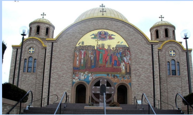
Ukrainian Church in Chicago