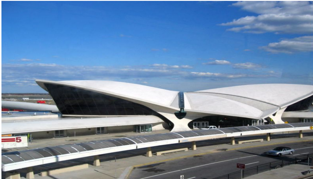
JFK International Airport in New York

When we arrived in New York it was early morning in Ukraine and we were so sleepy that it was hard to us to say a word or to make an extra movement. We had to go through our custom and passport control. The custom officer asked us one and the same question “What's the purpose of your visit?” We answered “Business. It’s a professional development seminar.” The custom officers, the porters, all the clerks and many other workers in the airport were black and my first impression of the city was “a city of black people.”