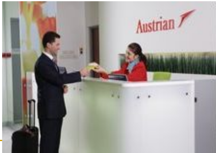
Registration for the Austrian Airlines flight

Everything started on June 19, 1998. We departed from Boryspil International Airport. It was not a non-stop flight. We flew from Kyiv to Vienna, from Vienna to New York, from New York to Washington. The longest trip was over the Atlantic Ocean. It took more than 8 hours and it was rather tiresome, though the service was great. We were given food twice and from time to time we could have some drinks. There were more than 12 music channels, built into our seats, and we could choose music to our tastes. There was a big screen in the middle and some films were shown during the flight. Films were broken a few times and we were shown some exercises to relax our bodies, information about the weather outside, the height of our flight, the countries we were passing by. We flew over Germany, Holland, England, Scotland, Ireland, Greenland, Canada. The countries below were so small, but so beautiful.