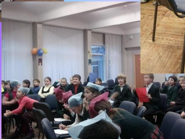
Внеурочная деятельность. Моя педагогическая инициатива.