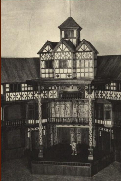
Entrance of The Globe Theater