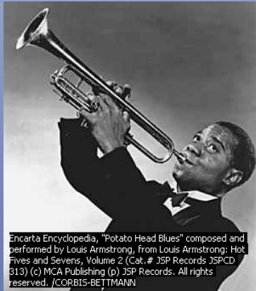
Encarta Encyclopedia, "Potato Head Blues" composed and performed by Louis Armstrong, from Louis Armstrong: Hot Fives and Sevens, Volume 2 (Cat.# JSP Records JSPCD 813) (c) MCA Publishing (p) JSP Records. All rights reserved.