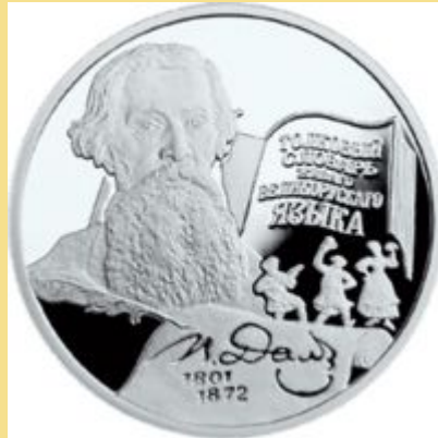
Memorial coin of the Bank of Russia on the Dal's 200 anniversary.