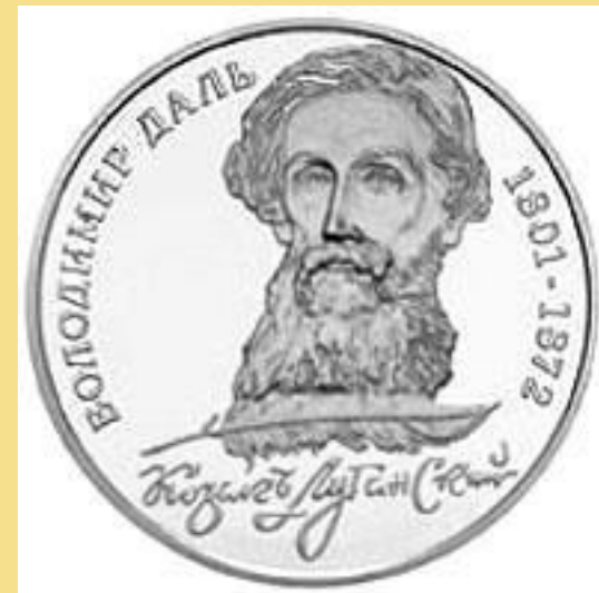
Memorial coin of the Bank of Ukraine on the Dal's 200 anniversary.