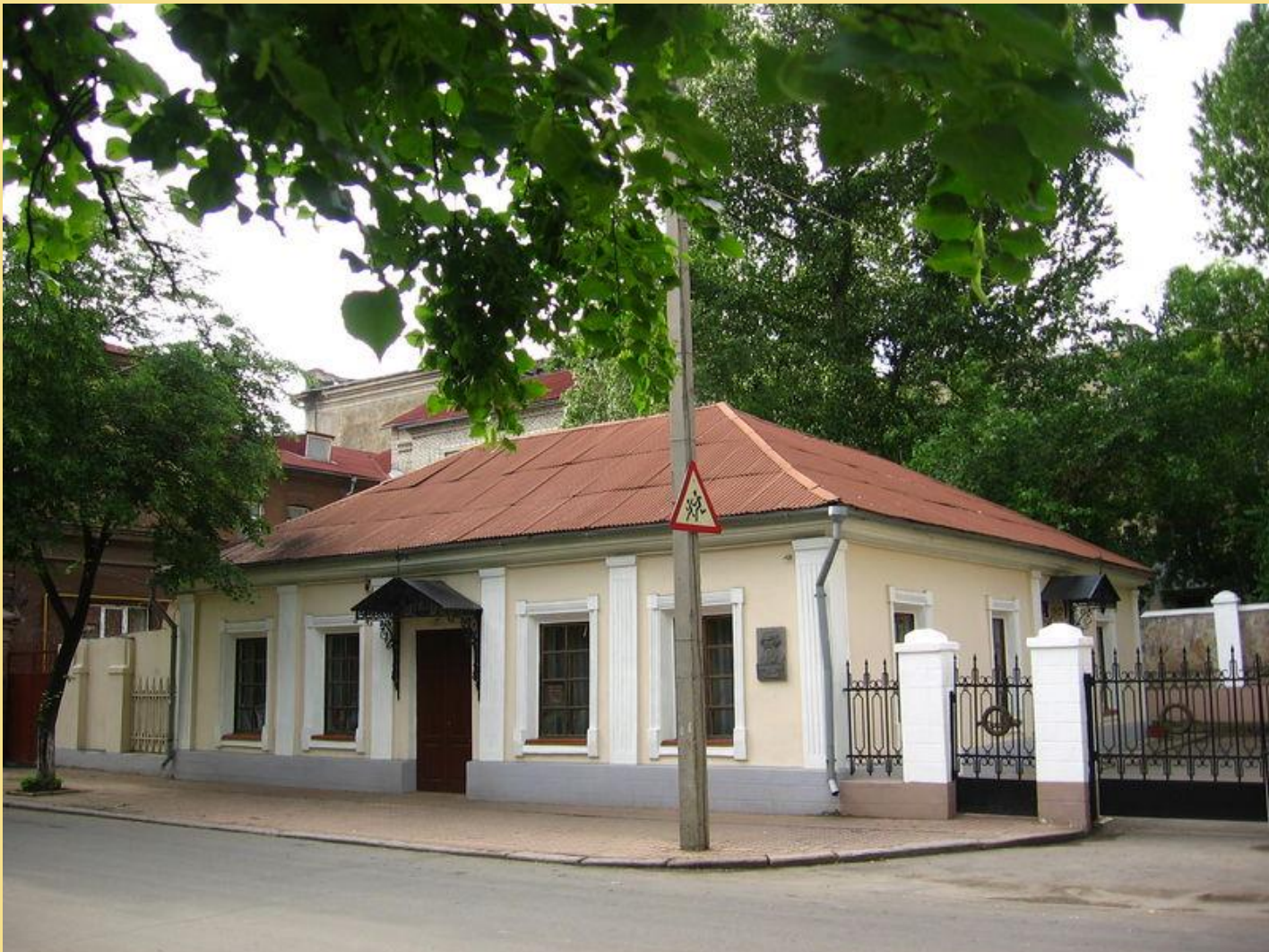
Dal's house and museum in Luhansk, Ukraine.