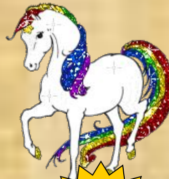
a hor se