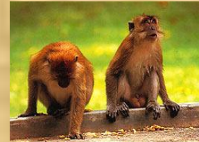
a mon key