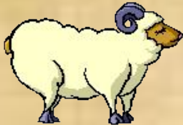
a she ep