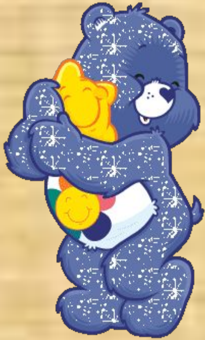
a bea r