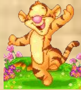
a tig er