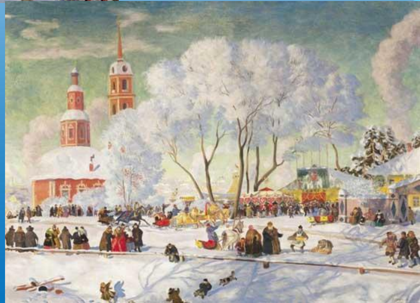
B.Kustodiev "Shrovetide" (1920)