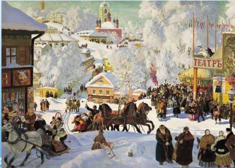
B.Kustodiev "Shrovetide" (1919)