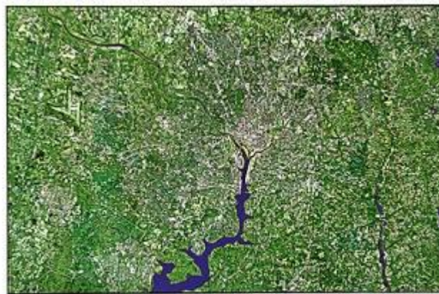
WASHINGTON D.C. FROM SPACE