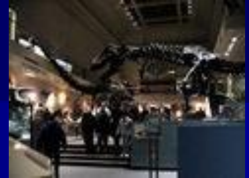
The Hall of Dinosaurs