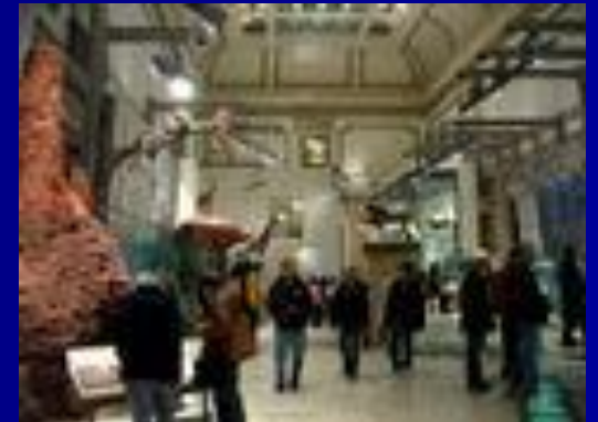
The Hall of Mammals