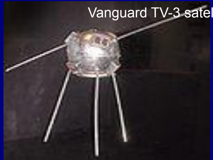
Vanguard TV-3 satellite