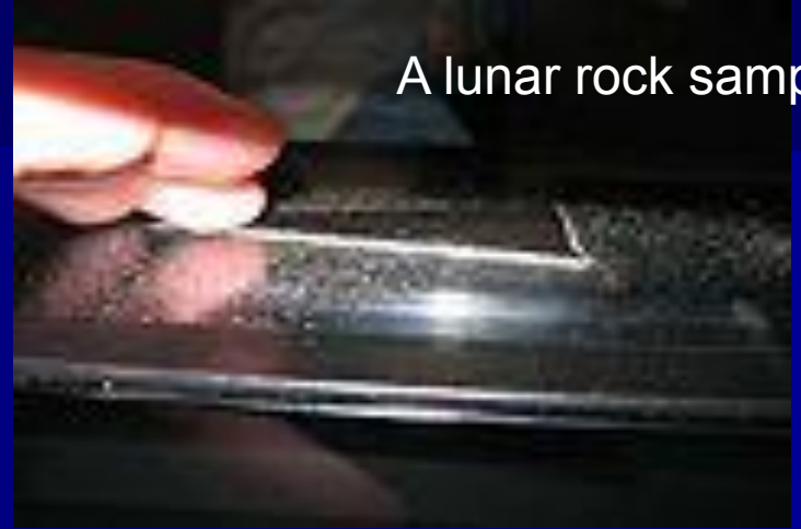
A lunar rock sample