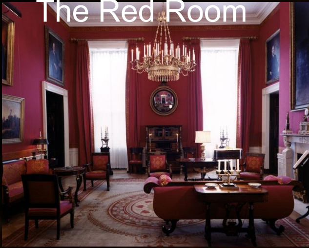
The Red Room