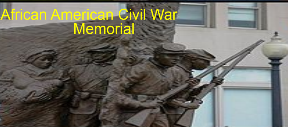
African American Civil War Memorial