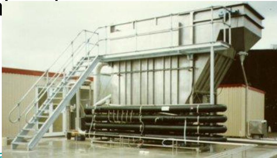
Dissolved air flotation system for treating industrial wastewater.