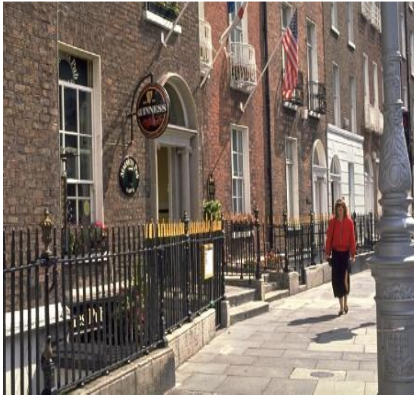
Streets of Dublin