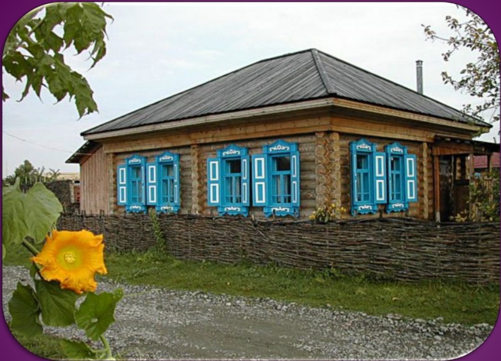
The house, where V.M. Shukshin spent his childhood and youth.