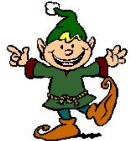
an elf - elves